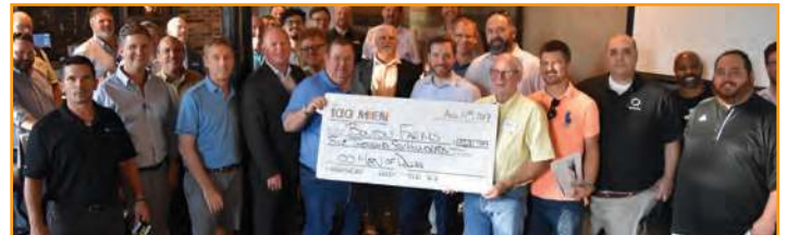
Donations are made four times a year

In August, $5,600 was awarded to Benton Farms.