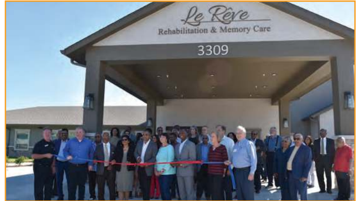
Ribbon Cutting for Le Reve Rehabilitation & Memory Care

David Weekley Homes is building 35 single family townhomes at 2015-2011 Highland Road, next to the future CENTER. The homes in this gated community will be 1,600+ sq. ft. and will sell for $350,000-$400,000. The Ferguson Townhomes development broke ground this summer. Ten townhomes are being built at 7839 Ferguson Road. Each townhome will average 1,650 sq. ft. and will be marketed to the middle-income community with a focus on educators, and fire and police personnel. Anticipated cost for these town homes will be between $250,000-$300,000. Le Reve Rehabilitation & Memory Care opened at 3309 Dilido Road.