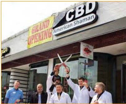
CBD American Shaman opened on Lower Greenville

Alamo Club opened in the old Blind Butcher space. La La Land Kind Cafe is a coffee shop employing foster kids who are aging out of the system. Young employees, ages 17 to 23, will learn to be baristas, cashiers and chefs. Flatbread Company will open at 1430 Greenville Ave. in the space where a number of automotive centers were located. Desert Racer is a Baja-style restaurant at 1520 Greenville Ave, which was most recently the location of Austin-based gastropub Haymaker. Sam's Club now is its own version of Amazon Go with no cashiers or registers. CBD American Shaman opened at 3611 Lower Greenville.