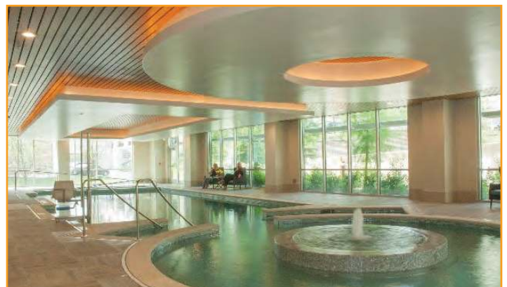
The Vista's Pool and Aquatics Center.

CC Young is a non-profit organization founded in 1922 and serving in East Dallas since the 1960's. Fulfilling our vision “to enhance the quality of life for all we serve,” we strive to create enriching experiences to celebrate life every day. Our verdant, 20-acre campus near White Rock Lake offers all levels of care for seniors from Independent Living through end of life – and everything in between. Our newest building is The Vista which transforms our campus and our care through forward-thinking, flexible, residential design, and technology. The Vista offers amenities not seen in North Texas such as an outdoor roof-top patio for Assisted Living residents as well as an Art Gallery for all to enjoy. The most notable new addition? An 8,500 sf Aquatics and Therapy Suite – for our residents, short-term rehabilitation guests, and eventually the community-at-large. The Vista is something you have to experience to believe. Schedule a personal tour to see for yourself! The Terraces Independent Living is our next offering. With unmatched views of White Rock Lake , the wait list is already growing. Reach out to our team to learn about tours and priority advantages for reserving early. For info and tours: www.ccyoung.org or call 214-258-4000.