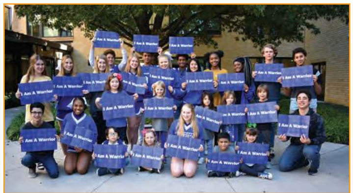
Lakehill Preparatory School students gave 16,000 hours of service

Students at Lakehill Preparatory School once again exceeded local, state, and national scores on ACT, SAT, and College Readiness. One hundred percent (100%) of Lakehill graduates continue to college, and are accepted into Ivy League schools, top research universities, liberal arts colleges, renowned art institutions, and international universities. Sixty-seven percent (67%) of the members of the Class of 2019 were awarded merit-based academic scholarships with a four-year value of five million dollars (an average of $180,000 per student). The Class of 2019 claimed one National Merit Finalist and Scholarship Winner and 12 AP Scholar Awards. Ninety-three percent (93%) of the Class of 2019 were enrolled in at least one Advanced Placement (AP) course during their Upper School career. In its inaugural year, Lakehill's Robotics team advanced to the World Championships. During the 2018-19 school year, students gave more than 16,000 hours of service to a variety of organizations throughout their community and around the world.