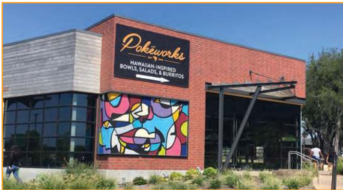
Pokeworks at The Hill on Walnut Hill Lane.

TruFusion is a mega-fitness studio from Las Vegas, which houses five studios under one roof. A major investor is former Texas Rangers Baseball slugger Alex Rodriguez . The 12,210-square-foot studio offers heated and unheated yoga, cycling, boot camp, barre, and Pilates. There are 65 class styles, up to 240 group classes per week, and taught by certified instructors.