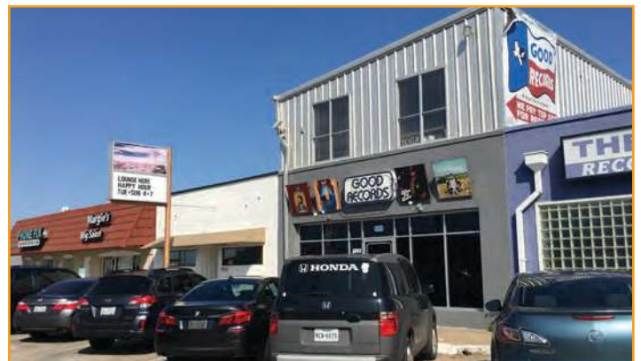
Good Records relocated to Garland Road.

The Mix Coworking & Creative Spaces/Kitchen is located in the basement level of the historic White Rock United Methodist Church, The Mix features a wide-open coworking space, with plenty of smaller spaces to work with small groups or simply a space for oneself.