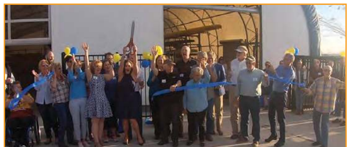
Dallas United Crew Ribbon Cutting

Six years in the making, the Dallas United Crew celebrated the boathouse dedication at White Rock Lake. City dignitaries and community leaders were in attendance to help with the ribbon cutting and acknowledge the strong partnerships and positive impact of the program.