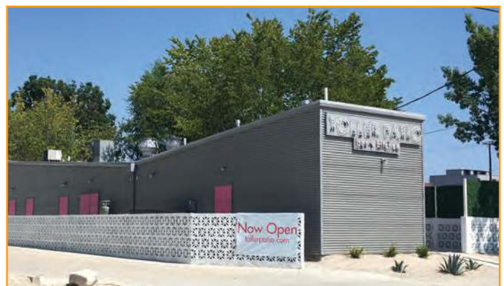
Toller Patio + Kitchen has a notably dog-friendly patio.

Southern Classic Daiquiri Factory serves Southern favorites like gumbo, fried catfish, red beans and rice. It features 15 flavors of daiquiris, three versions of the New Orleans hurricane, and other signature drinks. The restaurant at 3113 Ross Ave. occupies the space that was formerly Pilikiais tiki bar at 3113 Ross. Toller Patio Kitchen + Bar at 3675 Ross Avenue is a half-sibling to Hide in Deep Ellum, and is now open for business with 12 cocktails on tap, beer, wine, and a from-scratch menu of American classics. The restaurant has 15,000 square feet and is notably dog-friendly; it's named after the Tolling Retriever dog breed. Ross & Hall Kitchen + Beer Garten , at 3300 Ross Ave., is in a unique renovated building with a large dog friendly patio. The space was originally home to Little Woodrow's. Back Home Barbecue restaurant and drive-through at 5014 Ross Ave. has closed its operation as a dine-in spot. It has been taken over by its sibling Big Box Catering, and will be used for catering, delivery, and pick-up.