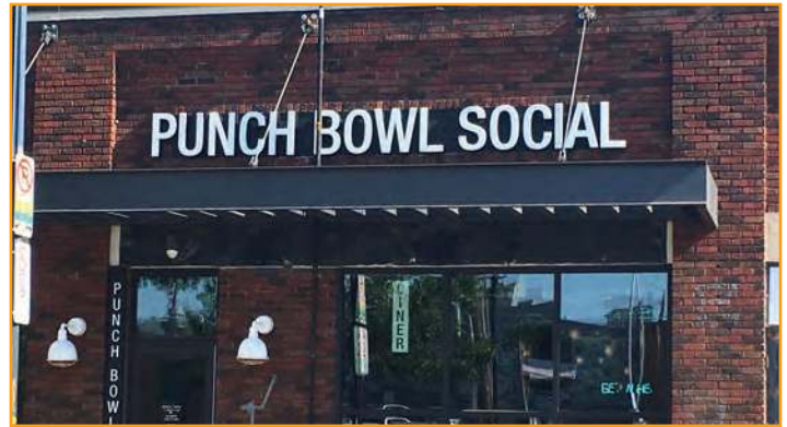
Punch Bowl Social combines food and beverage with games and social activities.

Closings: Baker's Ribs moved after 31 years, Glazed Donut Works, The Pharmacy, Wild About Harry's, Bowls & Tacos, Curtain Club, Don't Tell Super Club.