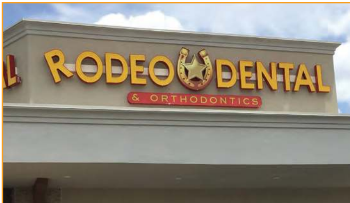
Rodeo Dental at Casa View Shopping Center