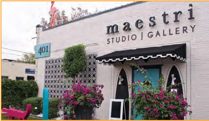
Maestri Studio | Gallery

Maestri Studio | Gallery at 401 Exposition Avenue started as an Architecture and Interior Design studio and has transformed into design, art, and all things modern and unique with regional artists, works found afar, a curated selection of retail goods, as well as a furniture collection. They are style-purveyors, statement makers, and believers in enlightenment by inspiration and beauty.