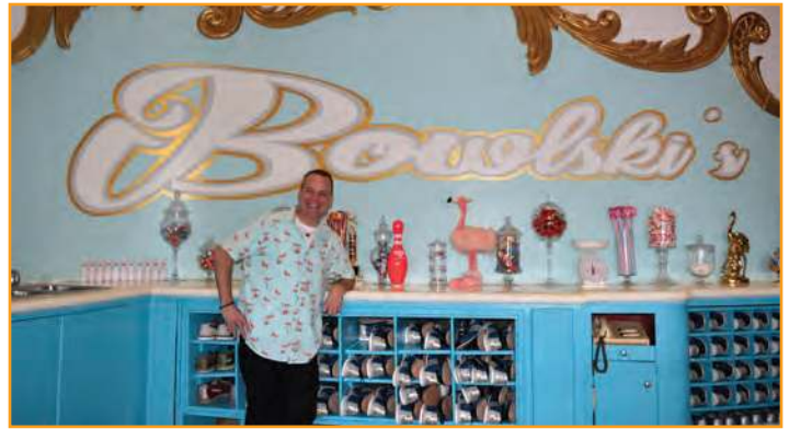
Bowlski's Lakewood Theater

The Good Local Markets opened another location at the Lakewood Village Shopping Center on the corner of Mockingbird and Abrams which operates on Sundays from 9 a.m. to 2 p.m. Utopia Food + Fitness opened next to Taco Joint, providing healthy