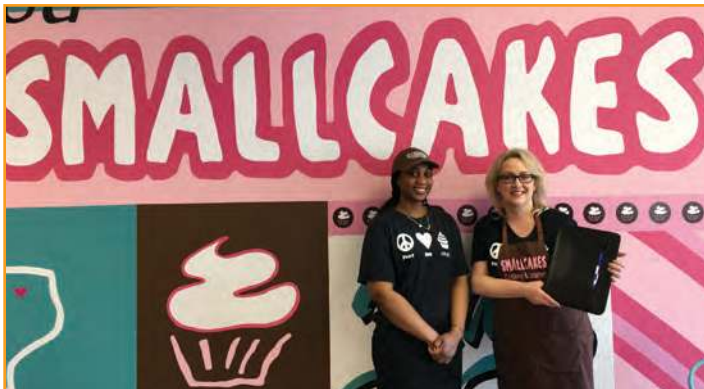
Smallcakes is open in Medallion Center.

Varsity Grill , the old-fashioned burger joint, closed after nine years.