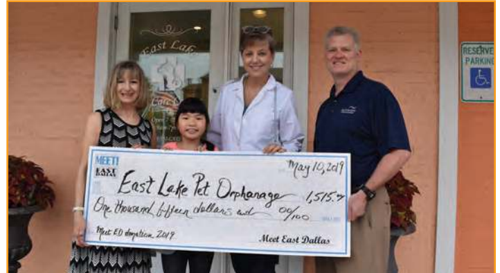
MEET! East Dallas check presentation at East Lake Pet Orphanage

Rock United Methodist Church's second campus. The building is undergoing renovation to house a variety of community-based nonprofit service providers: Grow North Texas is creating an urban farm. The Linden Grove Theatre is a children's theater. Dallas United Crew stores their rowing sculls and holds meetings and training sessions. White Rock Community Church holds worship services. Hope Supply Co. meets the needs of homeless children. Diapers Etc. provides a diaper bank for babies. The Aberg Center for Literacy offers educational programs, including building fluency, preparation for high school equivalency in English and Spanish, early childhood education, and family literacy. A community garden will break ground this fall.