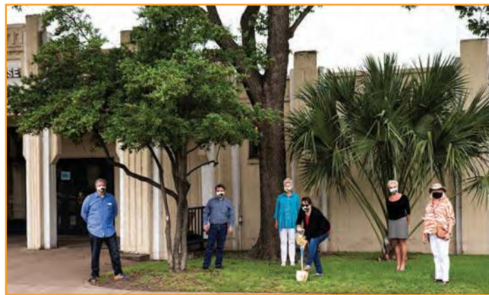
Groundbreaking for Bath House expansion.

The Bath House Cultural Center closed in late February for $1.5 million in renovations to improve the appearance and accessibility of the landmark site. It is the first major construction on the Art Deco building since it was built in 1930 and work will include kitchen renovations, bathrooms that comply with the Americans with Disabilities Act, plumbing and electrical improvements and better access to the lake level. Due to the coronavirus pandemic, performances will be streamed live by Undermain Theatre , East Dallas Arts and Dallas Children's Theater . Echo Theater is conducting online reading of plays. Planet Granite is planned to open in The Hill shopping center taking over the space most recently home to Candytopia, and before that, TreeHouse, the green home improvement company. It is a rock climbing gym featuring bouldering under natural light, a yoga studio, a full-line up of introductory and advanced climbing classes and a unique outdoor fitness area.