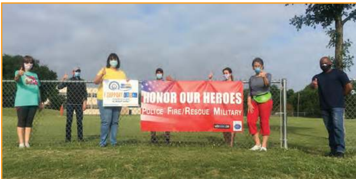
Ferguson Road Initiative.

CreekSide developments will bring quality service retail and amenities to a community that has been historically underserved. Creating a safe, walkable urban environment, with connections to Dallas' vast network of parks, trails and recreation centers, will make our community a place where people will have a sense of pride and will want to live and raise their families.