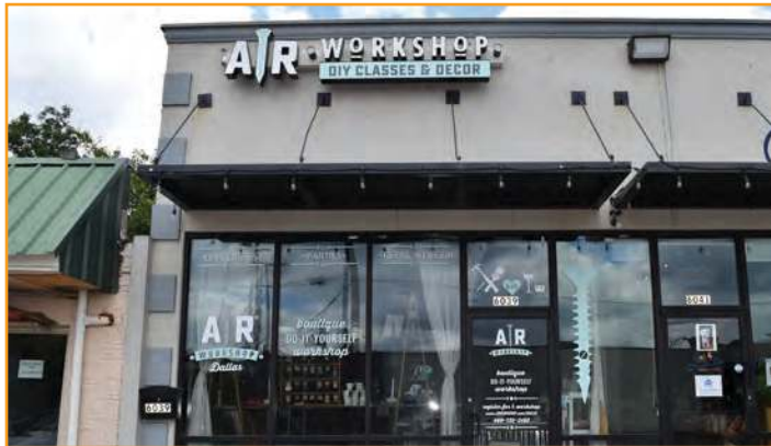
AR Workshop takes home decorating to the next level with DIY projects.

Oishii has opened a location at 5625 SMU Blvd. near US-75 in the space that was once Across the Street Bar and was most recently Spin Pizza. WannaEat Seafood is open in Mockingbird Station, offering Caribbean and Southern fusion-inspired seafood dishes. Lakewood Veterinary Center moved to 5726 Belmont Avenue. AR Workshop Dallas at 6039 Oram is a boutique DIY studio that offers hands-on classes for creating custom and charming home decor from raw materials taking home decor to the next level and have fun while creating it. There are DIY-to-GO kits, instructor led classes, kids camps, and booking for groups i.e., team building, bachelorette events, etc. Products can be custom made if DIY is not desirable.