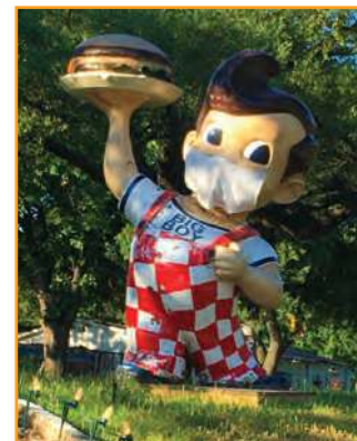
Kip's Big Boy sported a face mask.

Dallas-based premium sandal company Hari Mari has launched a new initiative that fits perfectly with the brand's socially conscious ethos: providing U.S. military and first responders with flip-flops designed specifically for prosthetic legs. Called Freedom Flops, they're made with a removable backstrap, allowing wearers to keep the straps intact to fit their prosthetic limbs. The first batch of 50