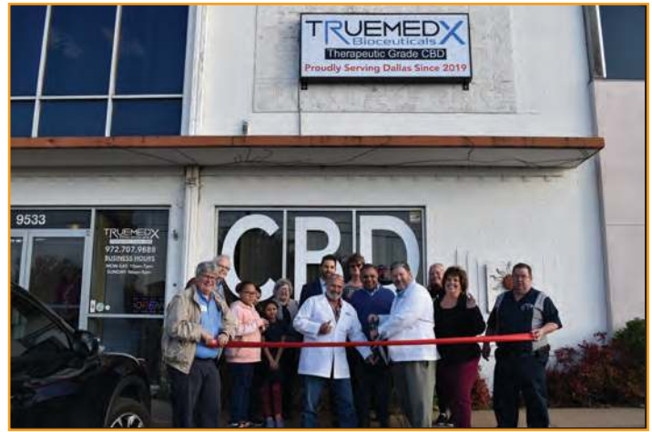
Ribbon cutting for TrueMedX Bioceuticals.