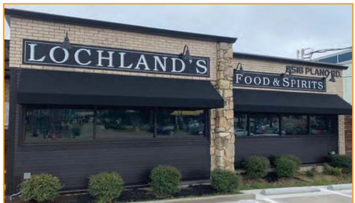
Lochland's Food & Spirits.

Jack & Ginger's is an Irish pub from Austin located below Caribbean-style bar 77 Degrees . Enrique Tomás provides a variety of Jamón Ibérico products in an 80-seat restaurant with an additional 75-seat lounge. It is the first store in the United States for the Barcelona-based business, which has locations in London, Paris and Mexico City. Dallas Proper is a new cocktail spot that opened in the former Mister Rich space. Zalat Pizza opened its first location in 2015 on Fitzhugh Avenue. Their eighth location will open in Addison and function as a "cloud kitchen" which will do delivery via third party apps or takeout through the website.