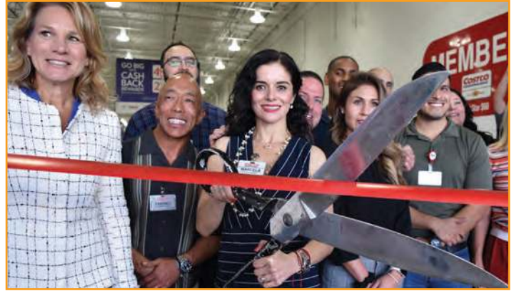
Costco Business Center ribbon cutting.

Penne Pomodoro, Stein Mart, Café Express, Nazca Kitchen (8 years).