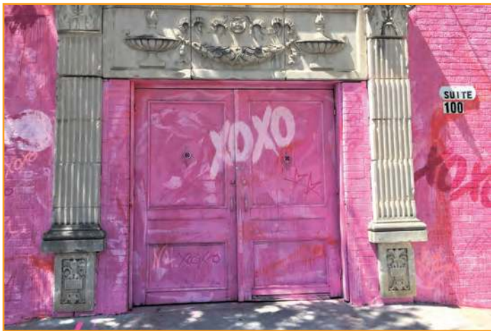
XOXO Dining Room.

XOXO Dining Room on 3121 Ross has a pink dining room with pink crushed-velvet booths, art-déco chandeliers, and oversized Champagne buckets. It also includes a speakeasy "Mr. X" cocktail lounge. The entrance is concealed, and you have to dial a phone number to get in. Invasion , a new indie restaurant on Crutcher Street specializing in fast, gourmet-quality food. WAYA Japanese Izakaya opened at 6334 Gaston Avenue in the old Creek Café location. CultureMap's Top Ten Quesos in Dallas included East Dallas establishments E-Bar Tex Mex , HG Sply Co , Matt's Rancho Martinez , Meso Maya , and Torchy's Tacos . Dahlia Bar & Bistro is opening on Ross Avenue in the former location of Ross & Hall and before that, Little Woodrow's.