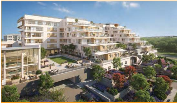
The Terraces is CC Young's next project.