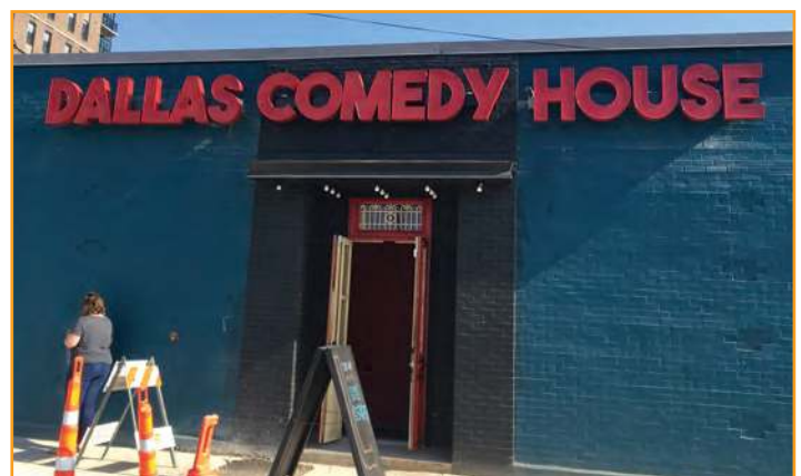
Dallas Comedy House.

The USA Film Festival celebrated its 50th Anniversary adhering to COVID-19 social distancing restrictions. Seating was limited and attendees were given assigned seats scattered throughout the auditorium. East Dallas Arts is a non-profit community theater group opening a new performance space at 10620 E. Northwest Highway. University Crossing Public Improvement District commissioned a 650-foot mural along Glencoe Park's retaining wall, adjacent to the U.S. 75 access road, spanning the entirety of the park from Martel to Ellsworth avenues. The colorful, geometric design reflects the district by incorporating a mockingbird, in a nod to Mockingbird Lane, and a pony, in reference to Southern Methodist University.