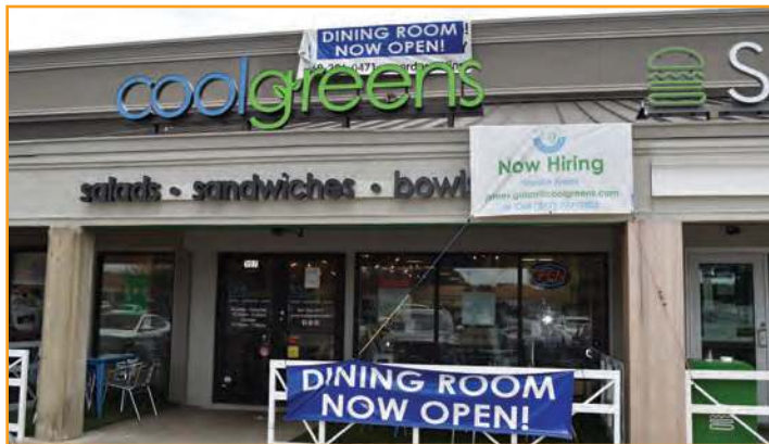
Coolgreens is one of three new restaurants in Old Town Shopping Center.

bread and homemade ice cream. Marugame Udon is a Japanese noodle shop which opened in the space that was once Baker Bros. American Deli. Coolgreens offers salads, sandwiches, wraps, bowls and flatbreads. The Oklahoma City-based chain is environmentally conscious. Plasticware is not available in the restaurant, and carryout containers are biodegradable.