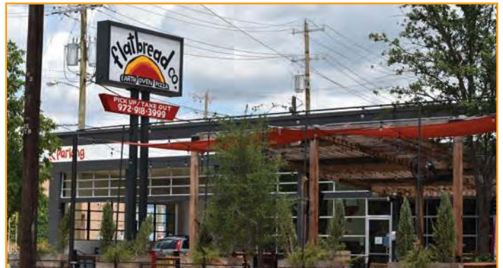
New restaurant Flatbread Co. on Lower Greenville.

Botolino Gelato Artgianale has a second location in Preston Royal Shopping Center. Flatbread Company opened at 1720 Greenville Avenue in a building that had been used as a car shop for years until Firestone opened in the space in the early 1950s. Standard Service , part of the HG Sply Co. empire, is on Alta Avenue, in the space that used to be Feed Co. Granada Theater has undergone major renovations over the past two years including a new roof and exterior paint to restore the theater to its original 1946 color. Chirps Chicken is a new Nashville hot chicken restaurant located in the former LG Taps space. Craft Boba Tea , formerly inside Zapp Kitchen, has a new storefront, and the business has expanded to include healthy drink options. The former LG Taps has been renamed The Chuggin' Monk . Son of a Butcher is opening in the former Melios Bros Char Bar location. Leila Bakery & Cafe is a boutique bakery opening in the former space home of Jack's Kitchen at 6041 Oram Street. Avenue Sports Grill opened in the space formerly occupied by 504 Bar and Grill. Swizzle is a Tiki bar luau lounge at 1802 Greenville Avenue in the former Rocko's Pizza space. Ngon Vietnamese Kitchen will open in September in the space most recently occupied by Shivas Bar & Grill.