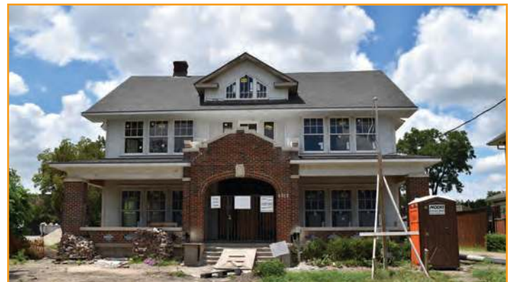
The Magdalen House will be a new treatment center to help women alcoholics.

Bonton Village will acquire 12.8 acres in Lake Highlands at 12000 Greenville between Forest Lane and LBJ to build a functioning farm and community destination. The homeless-to-work community is from the founders of Bonton Farms. Chamber member Greater Casa View Alliance donated $500 to the North Texas Food Bank in April 2020; and has pledged a similar amount for the acquisition of DISD student computers in September 2020.