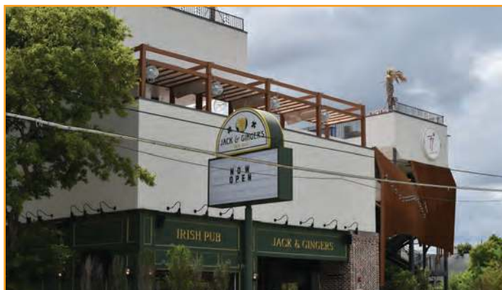
Jack & Ginger's Irish Pub on Henderson is below 77 Degrees.