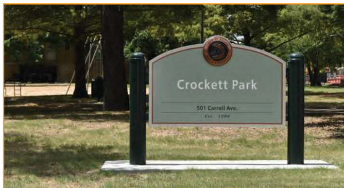
Crockett Park will become Crockett Dog Park.