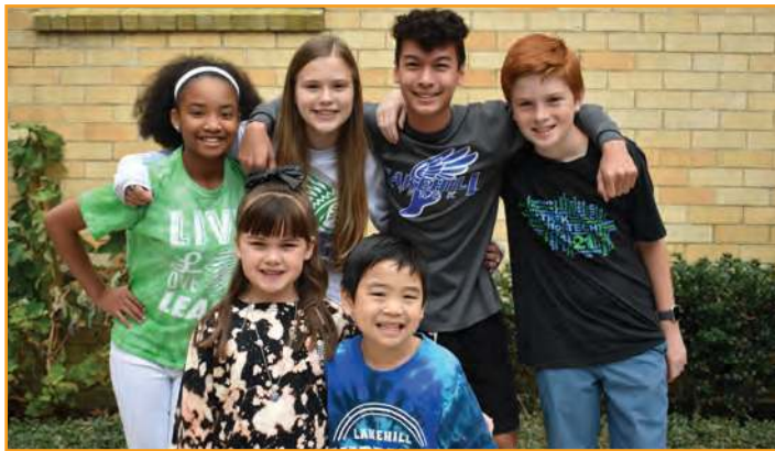
Young Lakewood Warriors.

Students at Lakehill Preparatory School once again exceeded local, state, and national scores on ACT, SAT, and College Readiness. One hundred percent (100%) of Lakehill graduates continue to college, and are accepted into Ivy League schools, top research universities, liberal arts colleges, renowned art institutions, and international universities. The Class of 2020 were admitted to 82 different colleges and universities. Sixty-eight percent (68%) of the members of the Class of 2020 were awarded merit-based academic scholarships with a four-year value of five million dollars (an average of $180,000 per student). The Class of 2020 claimed 11 AP Scholar Awards. Ninety-three percent (93%) of the Class