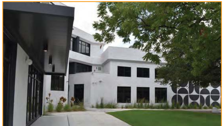
The Bogart on Ross Avenue resembles an art museum.